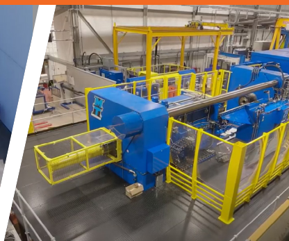
300-Ton Tri-Mode Rotary Friction Welder

Built and engineered for a leading Aerospace provider, this large-capacity linear friction welding machine weighs 200 tons and was transported on a flatbed to the East Coast.