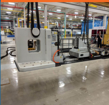
LF35-75 Linear Friction Welder

One of the largest linear friction welders in the world, the LF35-75 was designed and built at MTI's global headquarters in South Bend and was moved to its new home in Detroit.