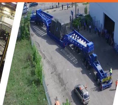
Two-Story-Tall Jet Engine Machine

Designed to complete an entire weld cycle without human intervention, this automotive machine was equipped with two robots and was re-installed in its new facility.