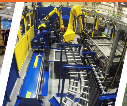
Fully Automated Axle Tube Machine

One of the largest linear friction welders in the world, the LF35-75 was designed and built at MTI's global headquarters in South Bend and was moved to its new home in Detroit.